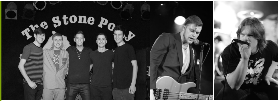
A few of the bands performing at Mya's Warrior Jam in Asbury Park