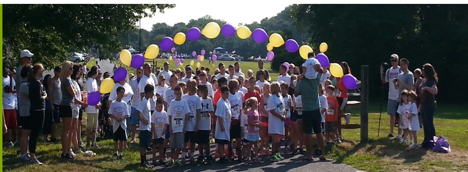
Children participating in Mya's Run For Gold September 14, 2013